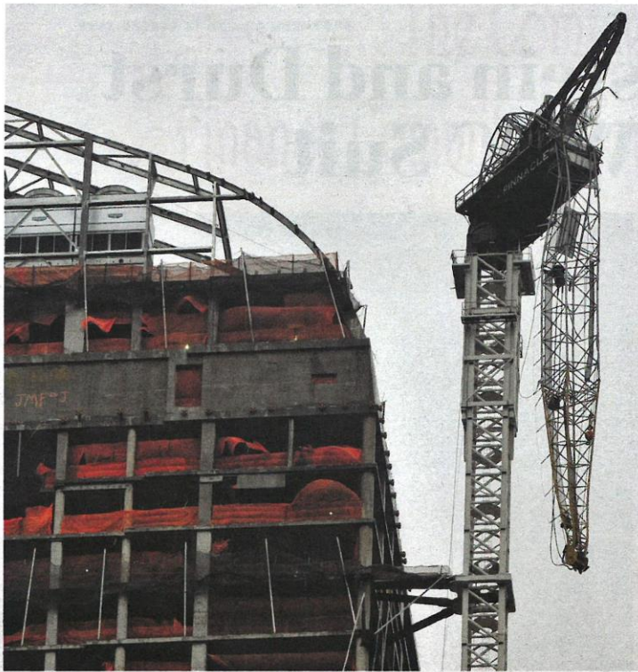
WHAT'S MISHAPPENING?: Construction fatalities rose in the first nine months of 2014.